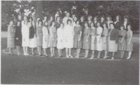
Group photo at the Southern Regional Meeting, in Athens, Georgia, October 1983.