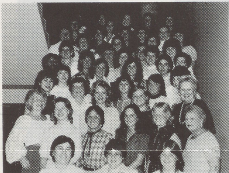
Participants at the Mid-Western Regional meeting in St. Louis, August 1983.

The Midwestern Regional meeting was hosted this year by Alpha Zeta Chapter in St. Louis, MO. We welcomed representatives from all the collegiate chapters in our region, but one; and also from several of the alumni chapters. On Friday, Aug. 5, registration was held throughout the day. After everyone had settled into their rooms at the Bel Air Hilton, we opened the hospitality suite as a group meeting place. As everyone enjoyed the snacks, liquid refreshment, and music, old friendships were renewed while many new ones were made. Several groups organized from here--some for sightseeing downtown and others to Laclede's Landing for food, drink, and entertainment.