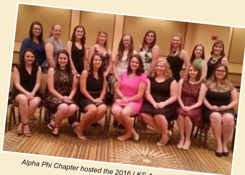
Alpha Phi Chapter hosted the 2016 LKS Annual Convention.