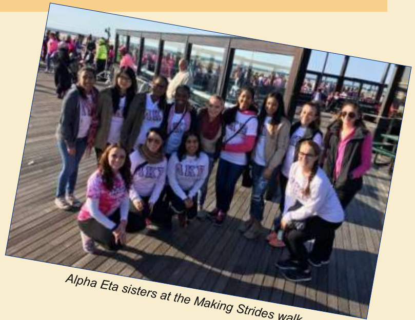
Alpha Eta sisters at the Making Strides walk