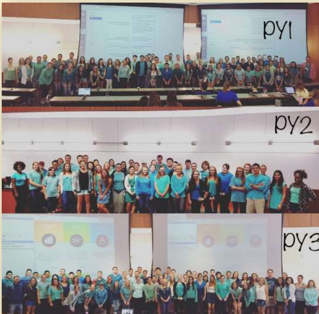
University of Kentucky College of Pharmacy students wear teal as part of the Teal Day challenge.