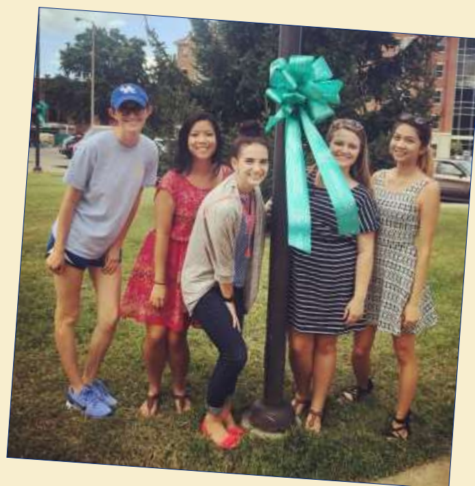
Alpha Nu members hang teal bows on campus.

This year, members hung up teal bows around the University of Kentucky's Markey Cancer Center. We also had a Wear Teal Day challenge, where we encouraged all pharmacy students to wear teal to classes. We had almost 180 students participate, and the winning class received donuts provided by Alpha Nu.