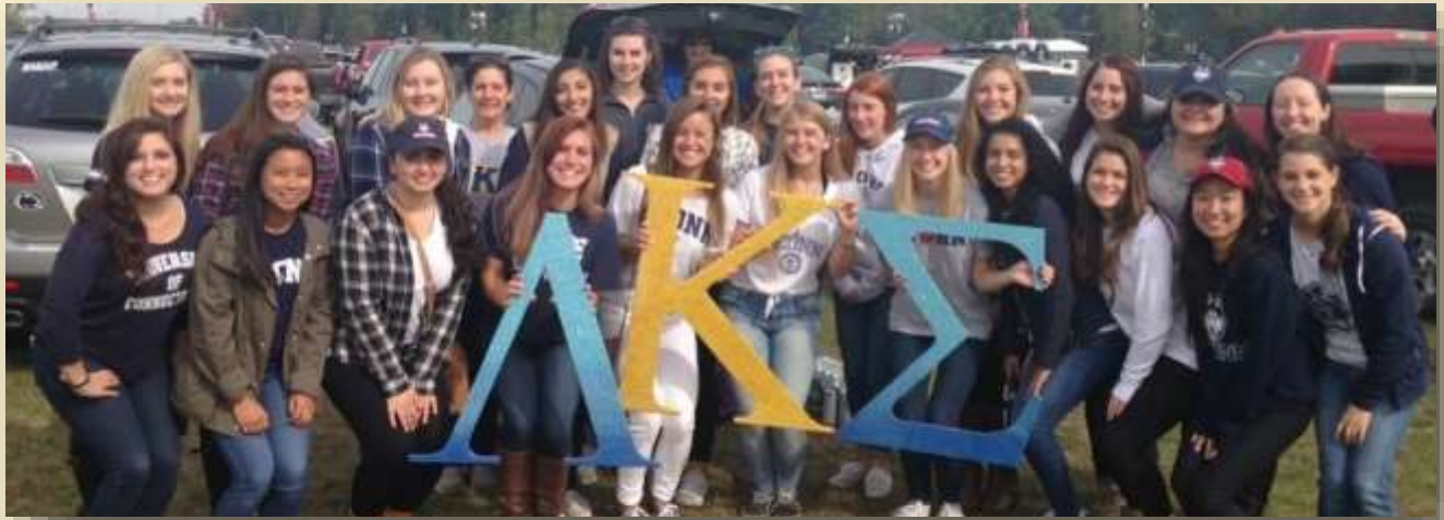
Alpha Beta alumni and collegiate sisters at the annual UConn Football tailgate