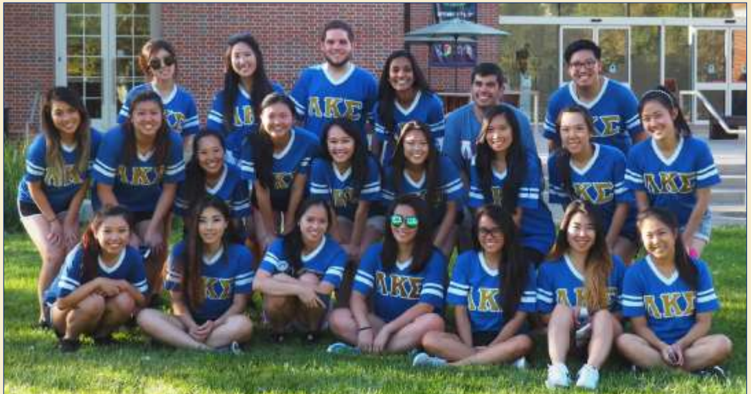
Alpha Xi participated in the Professional Pharmacy Fraternity Council's Olympics.

At our first-ever annual Professional Pharmacy Fraternity Council's Olympics, Alpha Xi sisters put up some fierce competition. We didn't take home the trophy (of vials), but we definitely met some new people!