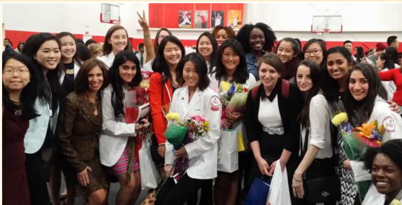
2016 White Coat Ceremony

We are continuing to increase communication with our alumni by sending frequent email updates regarding alumni and collegiate chapter activities, as well as promoting professional and community service events. We look forward to increasing participation from our new graduate alumni over the coming year.