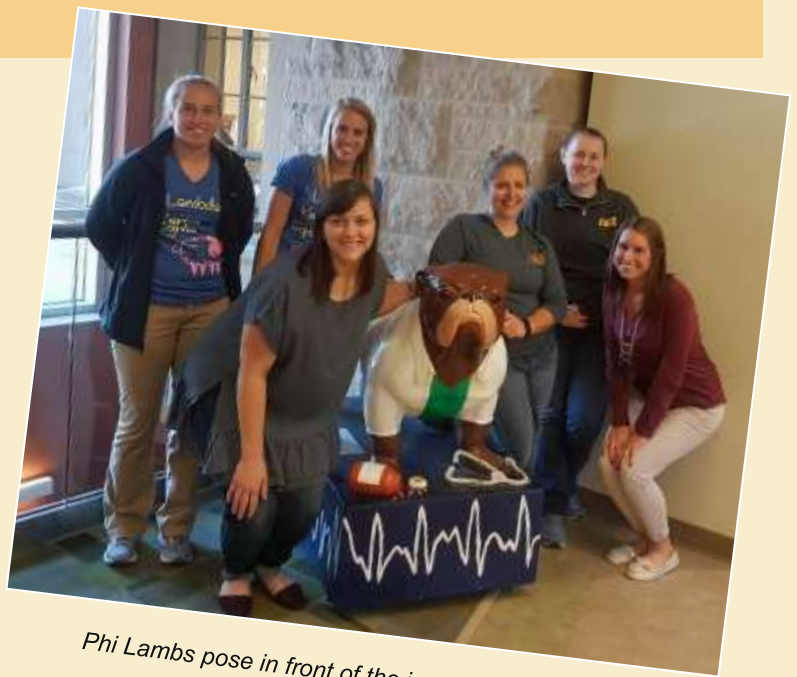
Phi Lambs pose in front of the iconic Butler Bulldog.

This year, we have decided to include more philanthropy and social events during the first semester in order