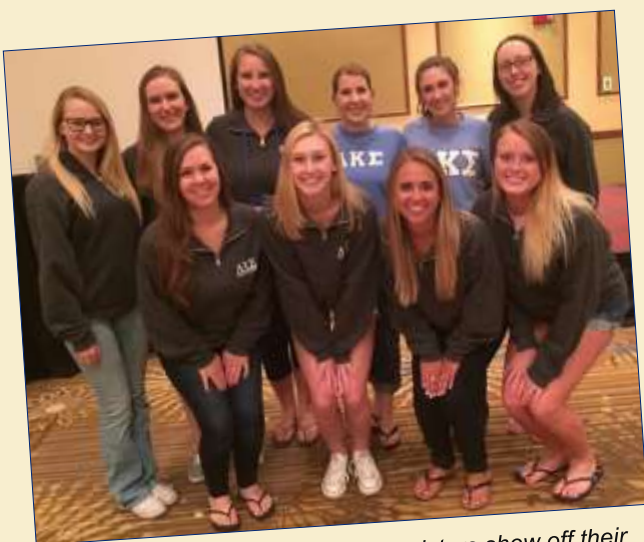
Alpha Beta alumni and collegiate sisters show off their matching letters at the Blue & Gold Dinner at the 2016 LKS Annual Convention in Scranton.