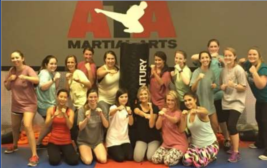
Alpha Kappa sisters attend a self-defense class.