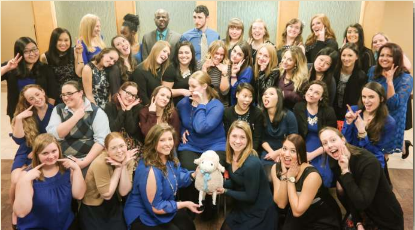
Alpha Psi's 2015 Spring Initiation Ceremony

sisters. We also sponsored a joint speaker event with the NEOMED Student Society of Health-Systems Pharmacists chapter. An ED pharmacist and two of his residents spoke about the role of the pharmacist in the ED and also about residency preparation. In November, we will be holding a business etiquette dinner.