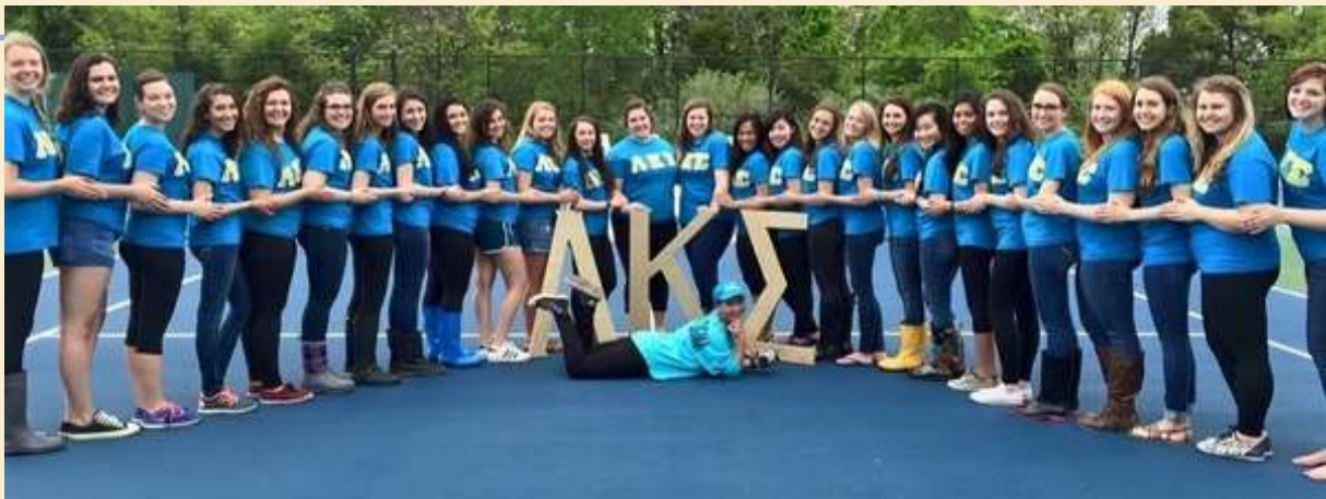
Alpha Zeta members pose after filming a recruitment video.

This fall, we hosted two very successful recruitment events and launched a recruitment video. Potential new members completed a service project where they raised over $900 for Project HOPE and an outreach project where they volunteered at a local ovarian cancer awareness 5K. They also performed in the school’s annual variety show event, taking third place in the Fraternity category! We were able to welcome 29 awesome new members into our chapter!