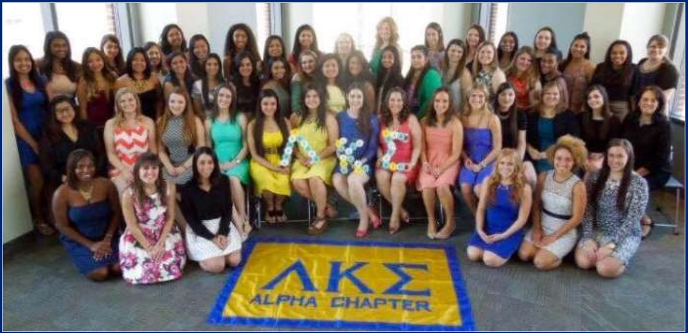
Alpha Alumni Chapter's 2016 Awards Luncheon