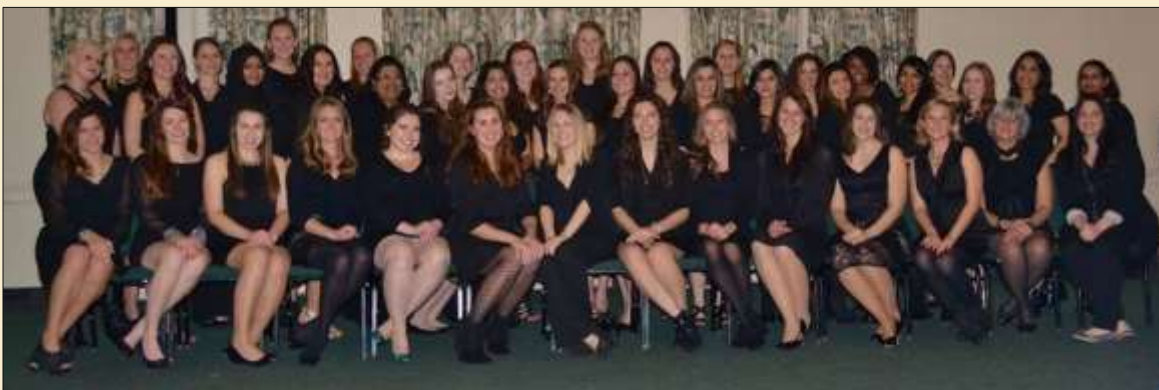
2015 Initiation Ceremony