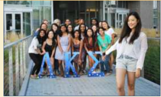
At their retreat, Pi Chapter members took recruitment photos.

wrote down a goal she wanted to accomplish through LKS. Also at retreat, we produced fall recruitment photos to symbolize that other sisters of LKS will always have your back while you fulfill your goals and grow as a member, pharmacist and person.