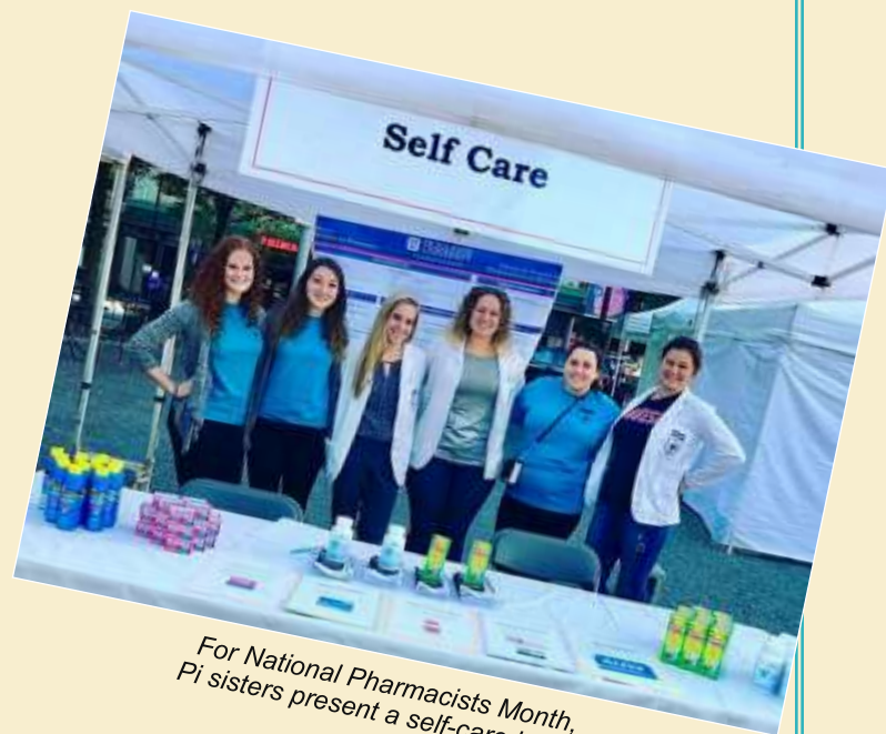
For National Pharmacists Month, Pi sisters present a self-care booth.

We have had various service events this semester, including volunteering at a blood drive. For our professional event, members are conducting research on the most common OTC medications in order to present to the public for National Pharmacist Month. HOPE Ball is our annual fundraising event, which was held on the Gateway Clipper. We raised approximately $1,200, which we are putting towards our goal of $4,000 to be donated to Project HOPE this spring.