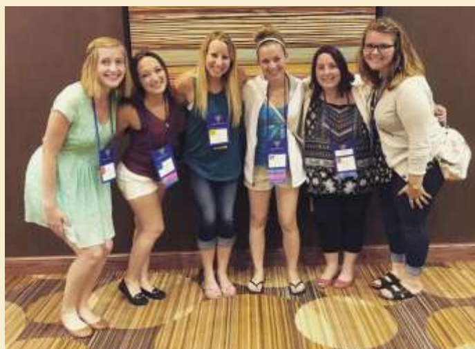
Alpha Iota sisters attend the 2016 LKS Annual Convention in Scranton.

Most recently, our chapter has been working on planning an event focusing on women's health. We are look-