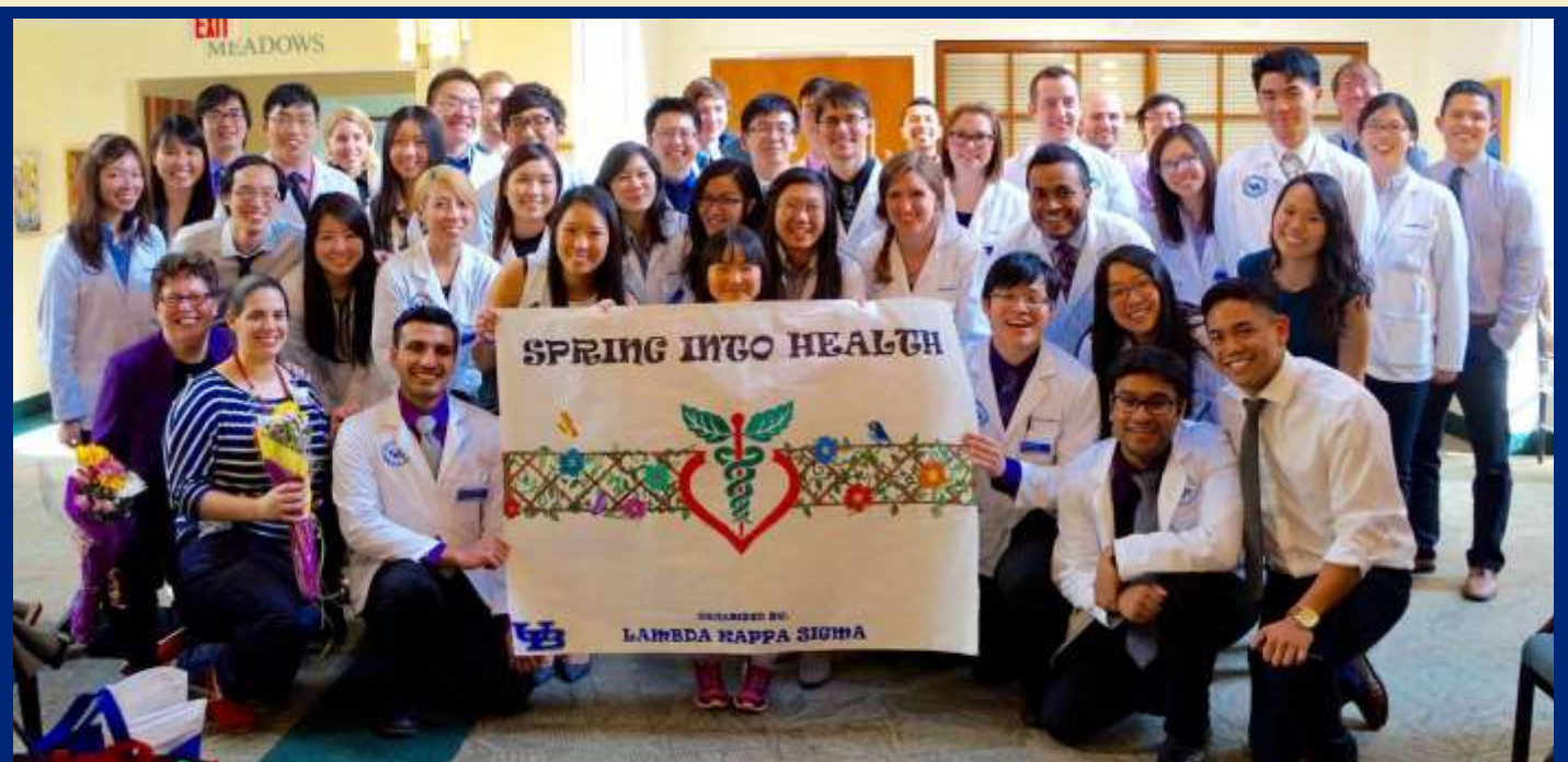
Members of Alpha Theta participate in the Spring Into Health, a health fair held for local senior citizens.