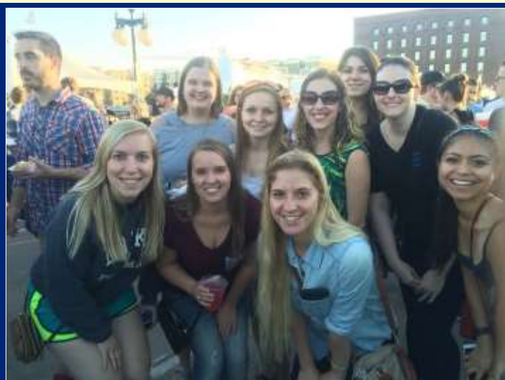
Nu Chapter members attend the World Food Festival in Des Moines, Iowa.