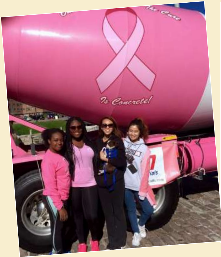
Beta Alpha sisters participate in Making Stride's Against Breast Cancer and raised over $300.

Also, sisters also posted the page on individual pages to garner more support. We held a 50/50 raffle on campus, which was a great success and raised a majority of the proceeds. Our chapter was delighted to exceed our goal and raise $313! The walk took place on October 15th and was a fun event for all sisters in attendance. We are thankful for all the support!