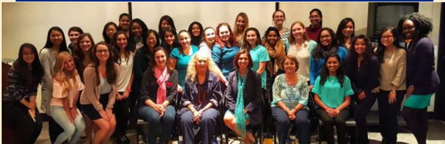
Alpha Pi collegiate and alumni members come together Breast/Ovarian Cancer Awareness Night.