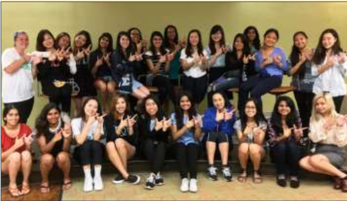
Pi Chapter held a creative “Ba-Goals” breakfast event.

The theme of our chapter this year is “Growth” because we only have little over 20 active members. We held a retreat on September 5 to generate excitement and prep for the upcoming semester. One of the first activities included goal setting. Sisters were asked what they wanted to achieve this year (more sisters at the Dance Marathon, better fundraising for convention, etc.) Then, sisters were asked how we could achieve those goals. The overarching answer was everyone contributing—each sister living up to her potential. We also want every sister to grow this year in her own right. As part of our Make It Happen! initiative, each sister