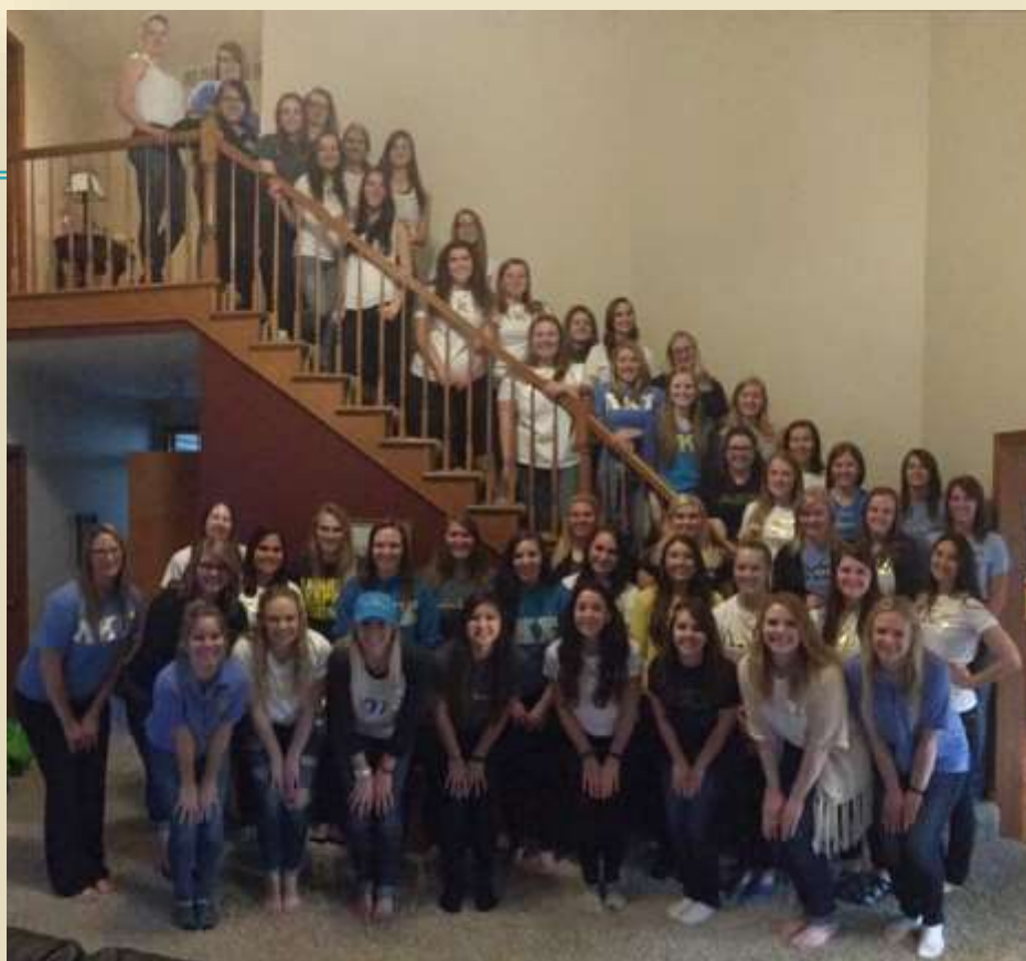
Alpha Iota members gather for their Spring 2015 retreat.