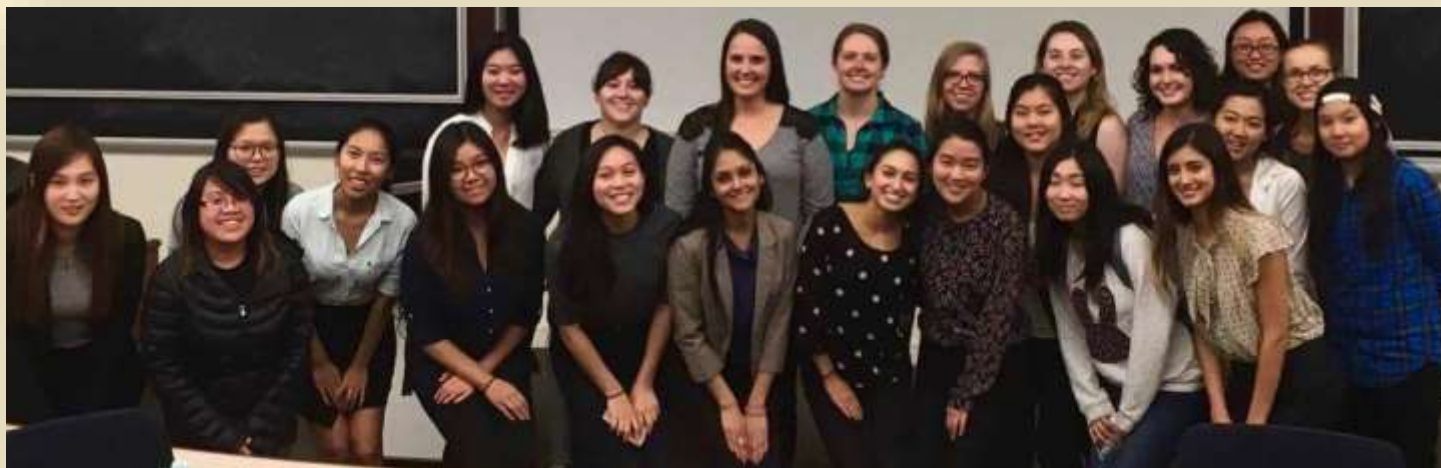
Alpha Rho sisters and PNMs gather to learn about residency and geriatric care.