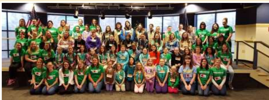
Members recognize 2015 Hygeia Day by aiding Girl Scouts.

This coming semester we are looking forward to growing our chapter with the addition of new members and will be participating in the university's Alcohol Awareness Walk. We will also be continuing our annual Turkey Tea tradition to raise donations for the local Salvation Army.