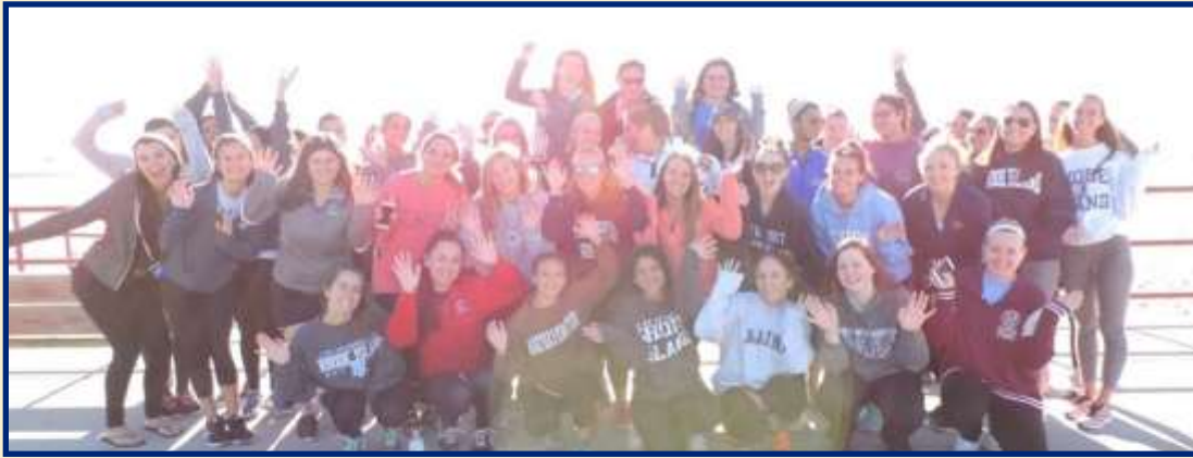
Beach clean up at Scarborough Beach with potential new members of X Chapter.

The Community Service Committee put on a successful beach cleanup for the potential new members to learn how Xi Chapter is always looking for ways to give back to our community. The committee also organized for our chapter to volunteer at this year's Crohn's and Colitis Foundation of America walk in Providence. Sisters will be roadside cheerleaders and running activities for children.